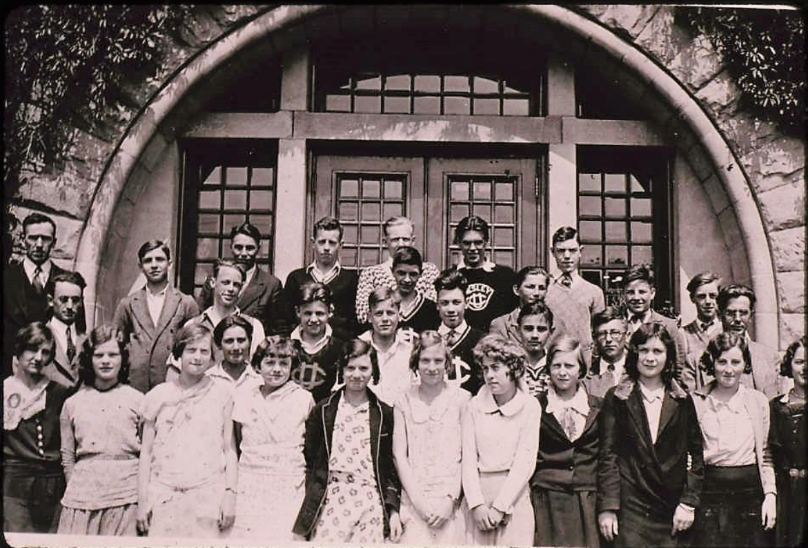
Resident Collegiate students, Wesley College, 1931

FEBRUARY 2023 NEWSLETTER: INAUGURAL EDITION