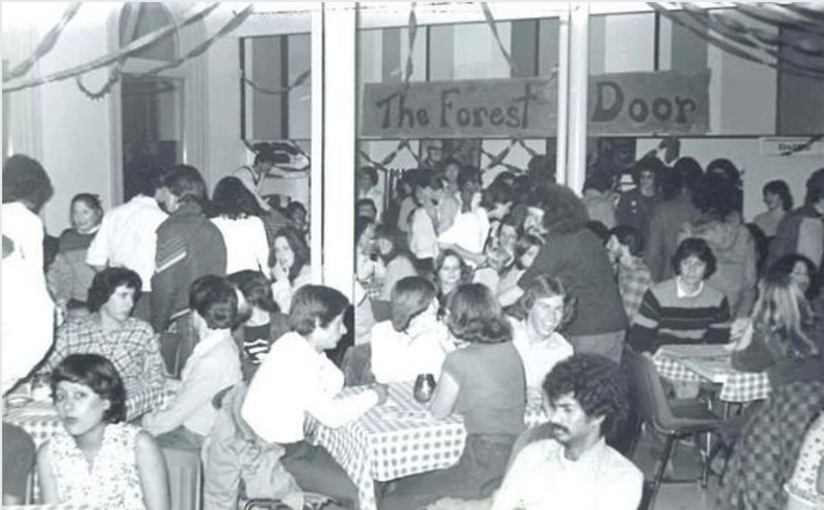
Coffee House 1981

Do you recognize anyone in this photo of students gathering for Coffee House entertainment in 1981? The Collegiate continues its Coffee House tradition to this day, featuring the artistic talents of students, faculty and staff.