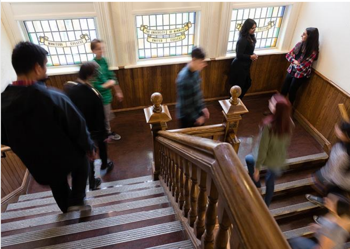
The bustling stairwell of Wesley Hall today.